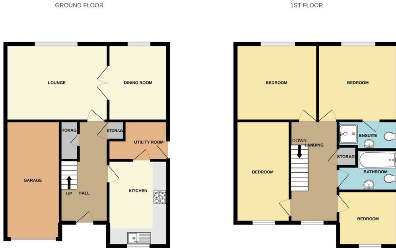
11 BUSHY CLOSE, LONG EATON

Whilst every attempt has been made to ensure the accuracy of the floorplan contained here, measurements of doors, windows, rooms and any other items are approximate and no responsibility is taken for any error, omission or mis-statement. This plan is for illustrative purposes only and should be used as such for any prospective purchase. The services, systems and appliances shown have not been tested and no guarantee as to their operability or efficiency can be given. Made with Metropix ©2022